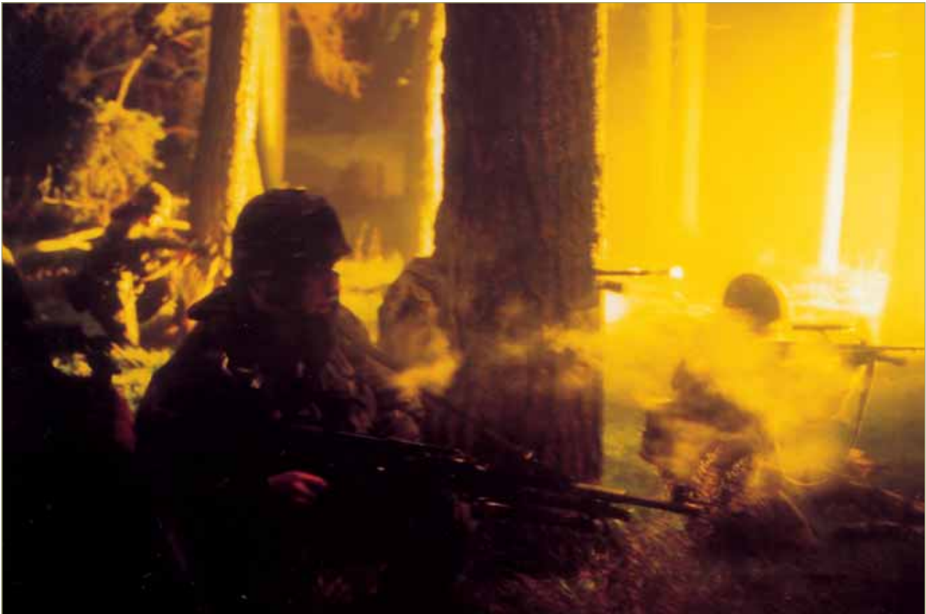
A profound process of equalisation is under way between Europe and the United States spanning economic, foreign policy, political and security issues.

1 The so-called Petersburg Tasks, defined in the Treaty of Amsterdam as "humanitarian and rescue tasks, peacekeeping tasks, and tasks of combat forces in crisis management, including peacemaking." Named after the German official government guest house, where in June 1992 the WEU was tasked in strengthening of its operational role in several ways and widened its function for the employment of forces. The tasks do not include core commitment of a classical military alliance. There is no provision for a mutual security guarantee.