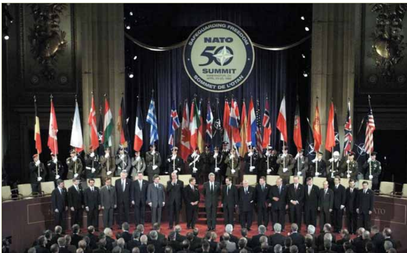
Although the EU and NATO are moving closer, the Rapid Reaction Force has a very different purpose from the Western Alliance. Unlike NATO, the EU force does not involve a mutual defence pact, and participation in each operation is voluntary.

the so-called headline goal date of 2003 as outlined at Helsinki. The Rapid Reaction Force has therefore been inspired by a perceived common interest in a stable border region for a greatly enlarged EU, and a desire to help those states develop and avoid political and natural disasters. Although the EU and NATO are moving closer, the Rapid Reaction Force has a very different purpose from the Western Alliance. Unlike NATO, the EU force does not involve a mutual defence pact, and participation in each operation is voluntary. Decisions to use the military instrument of the ERRF are exclusively in the hands of national government ministers who can only act by unanimity. Thus any deployment of the ERRF is for decision on a case by case basis and will be subject to the right of veto by any member state. In effect if so much as one state says no, then quite simply the force cannot be deployed.