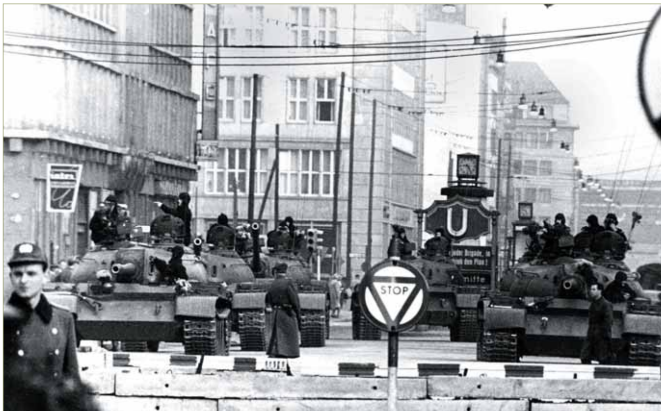
The fall of the Berlin Wall, German reunification, the demise of the Warsaw Pact, the flowering of democracy in former Communist central Europe. These events caused a seismic, paradigm shift in security perceptions at the end of the Cold War.

Defence Ministries. In 1997 an enhanced PfP programme was introduced which had a more operationally focused role. Politically on the European stage events began to move along. Foreign and security policy integration within the EEC/EU had always been the most difficult question. Indeed it was this debate that lay at the heart of the divide between Federalists and Intergovernmentalists. Under these circumstances, the evolution of what we call a Common Foreign & Security Policy (CFSP)