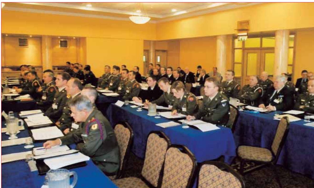
RACO delegates at the 13th ADC in Tralee.