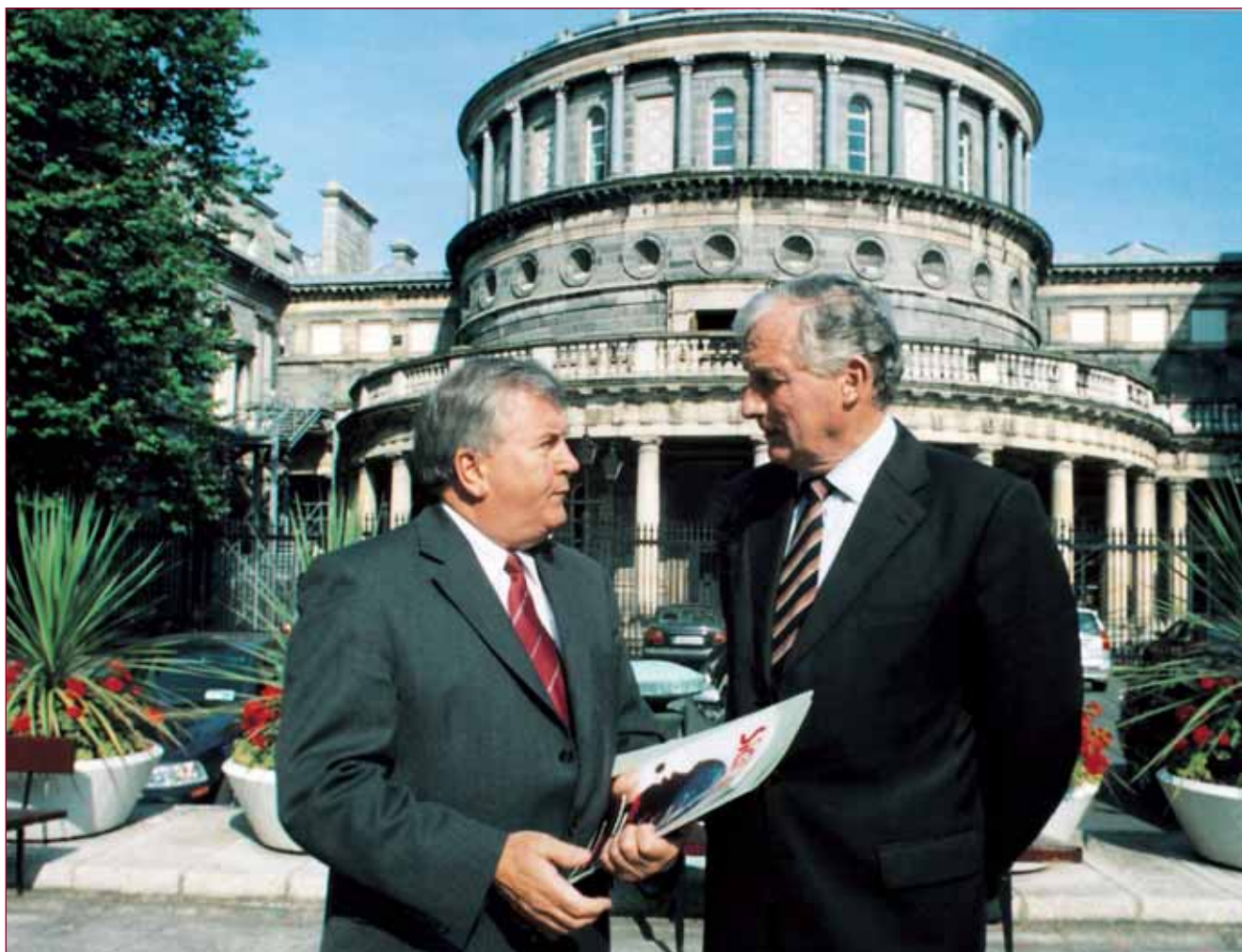
Senator Terry Leyden with Minister for Defence Michael Smith outside the Dáil.

peacekeeping and peace enforcement abroad. That’s one area where I feel they have a very big role. Even though we very much reinforced the neutrality side of the Nice Treaty, the fact is that clearly we would be part and