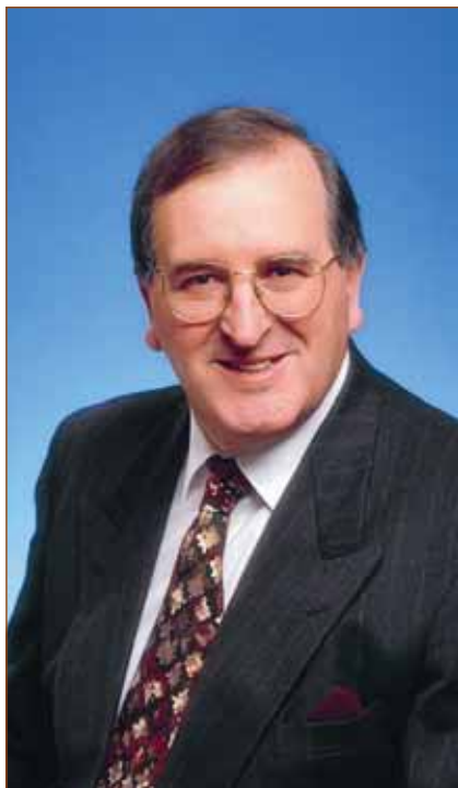
Senator Maurice Cummins

same level of input financially as its two counterparts. One part of an equation must get the same fuel as the other. I would certainly like to see that resolved to everybody's satisfaction."