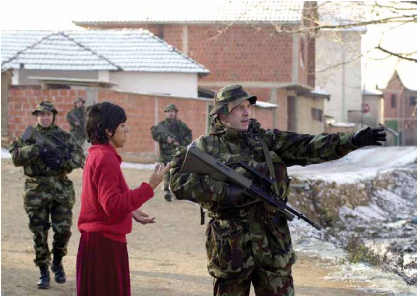
Irish troops on patrol in a Gypsy (Askali) village in Kosovo.

troop contributors for UN, EU or NATO operations may be EU members, NATO members or third countries. I don't think there is any preference; I just think that we must ensure that our training and our equipment are to the highest international standards.