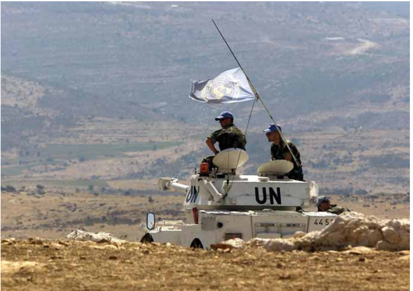
Irish troops on observation with the UN in Southern Lebanon in 2001.